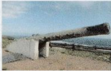
Sacramento Cannon at Cape Recife

This bronze artifice, cast by the Bocarro family, also known as the Miracle Cannon, was salvaged in May 1977 from the Shipwreck site of the Portuguese Ship- Sacramento , which ran aground near Schoenmakerskop on her maiden voyage in 1647. It was declared a National Monument under old NMC legislation on 7 March 1986. Wording on English commemorative stone: