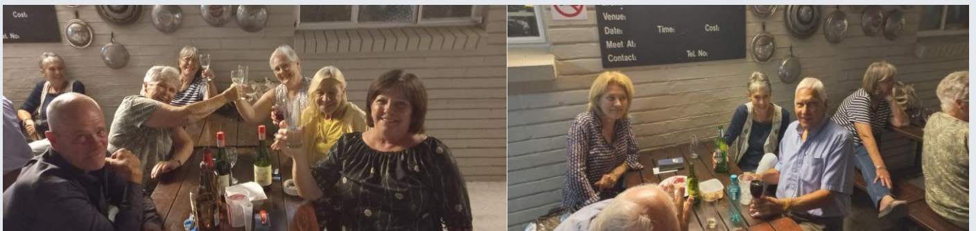
The naughty tables