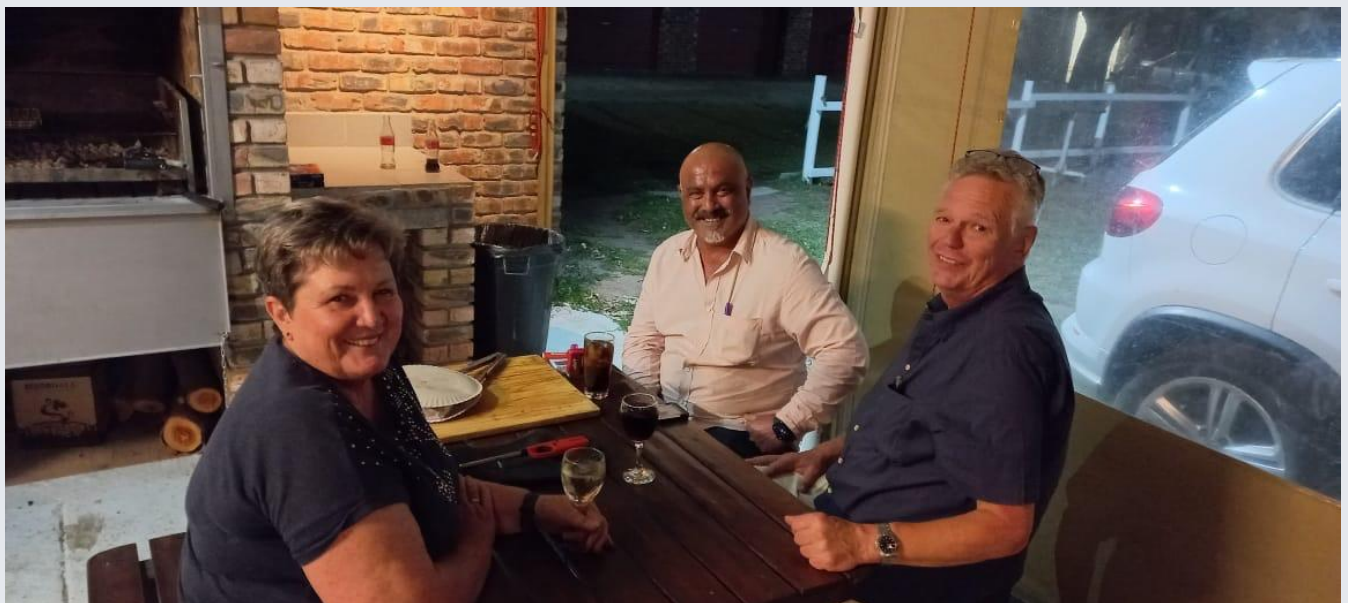
Smiles all round