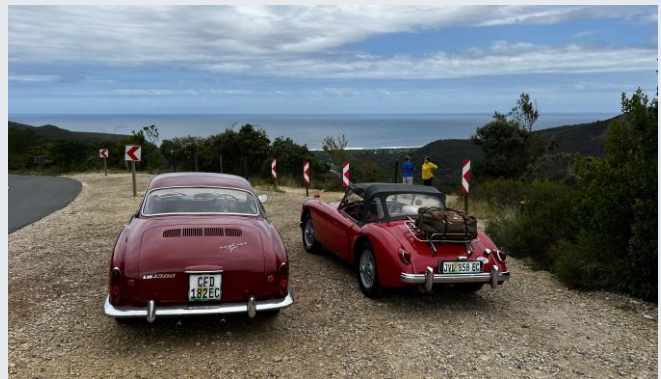
On the way at Groot Rivier Pass Natures Valley